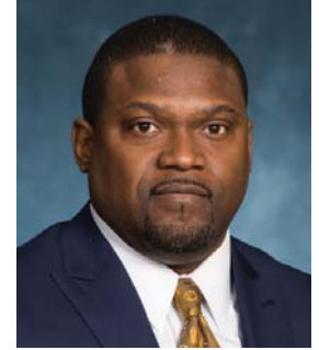
TYRONE WHEATLEY Running Backs